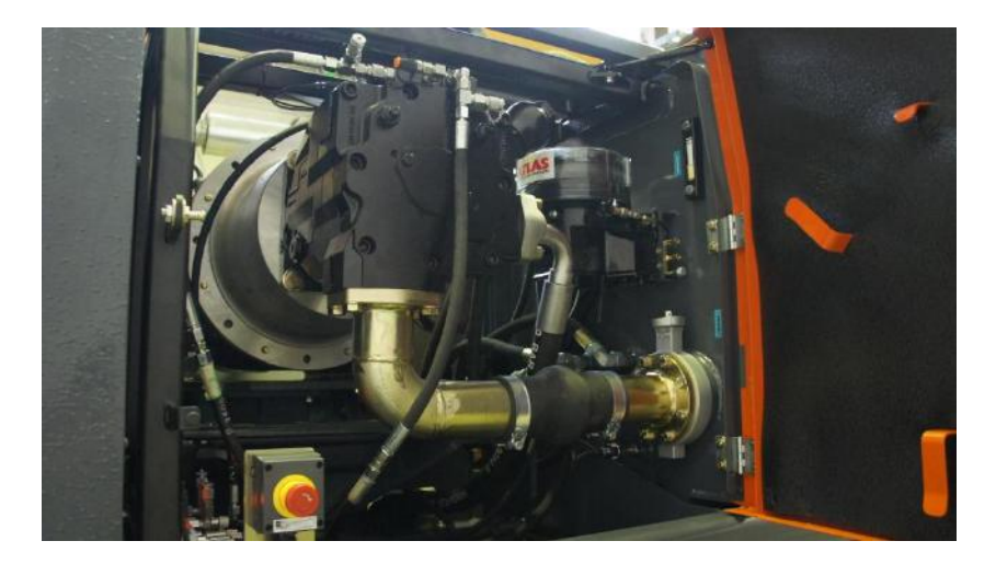
Main pump and lockable suction flange