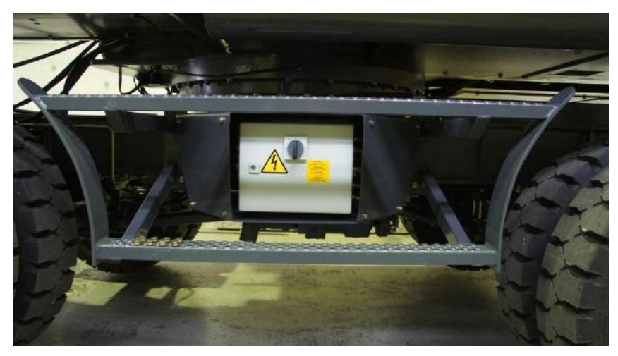
Lockable master switch